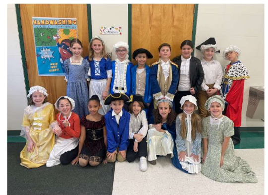
Top left to right: Science Fair, Robotics Competition, Revolutionary War studies in 4 th grade. Bottom left to right: Reading buddies, Makerspace challenges, and enjoying the eclipse.