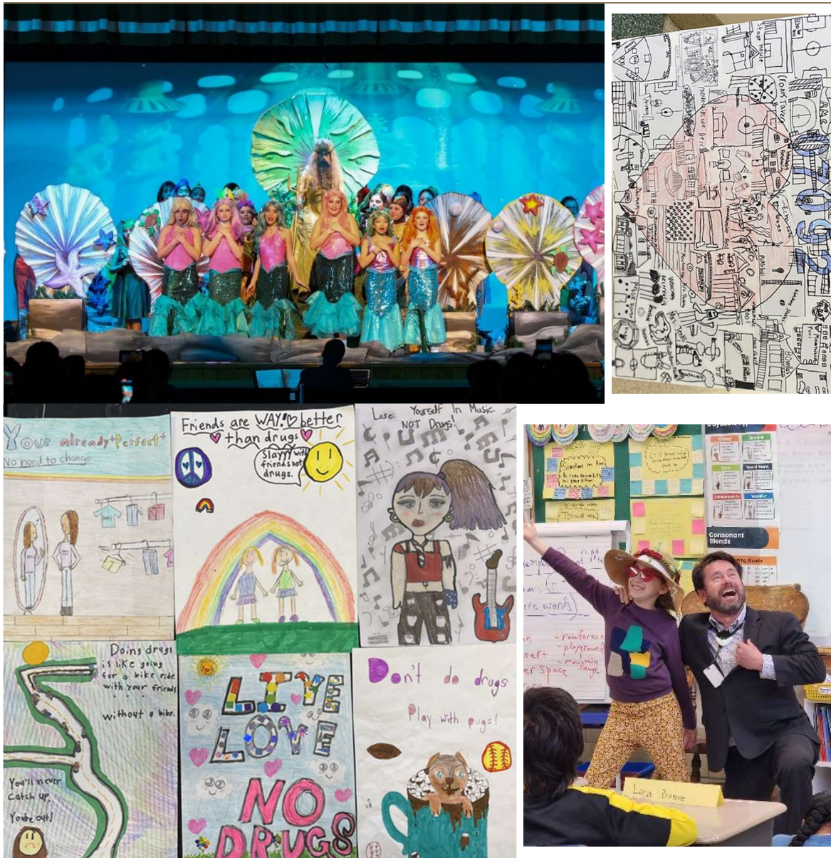
Spring Musical performance of “The Little Mermaid” makes waves with rave reviews! Red Ribbon Week Poster Contest inspires creative positive messages. Poets in Residence for 5th Graders, sponsored by the MEF.