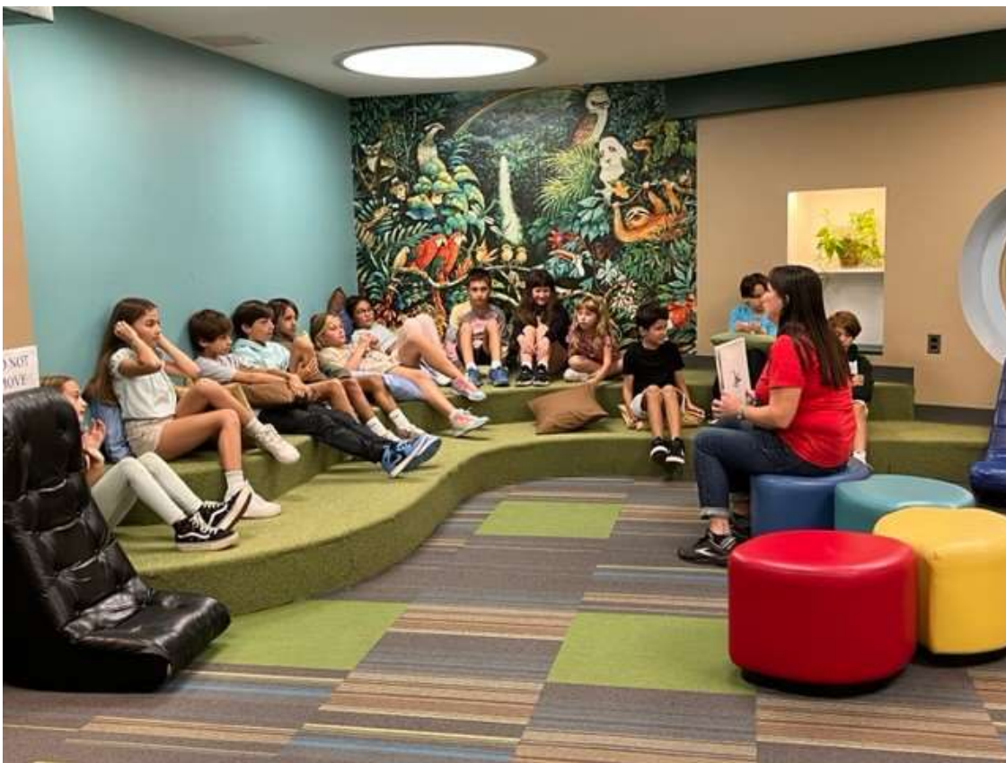
Deerfield students enjoy learning in our modern media center.