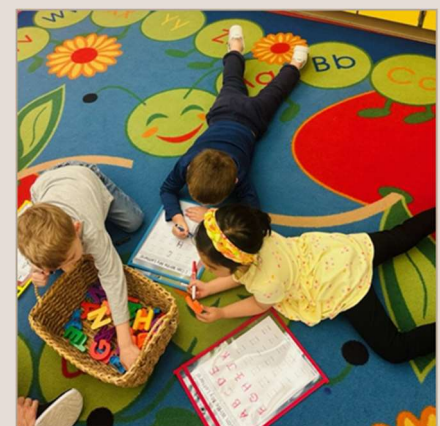
Above: Experiments in Science Labs, Makerspace Engineering, and Eager Readers show the hard work and education in motion in Deerfield and Beechwood Schools.